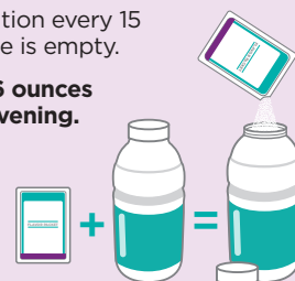
Bottles and packets not shown actual size.

IMPORTANT: If nausea, bloating, or abdominal cramping occurs, pause or slow the rate of drinking the solution and additional water until symptoms diminish.