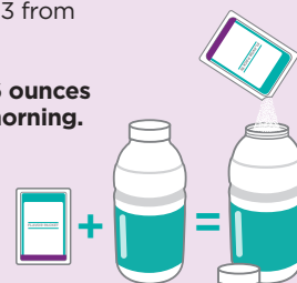
Bottles and packets not shown actual size.

IMPORTANT: Continue to consume only clear liquids until colonoscopy. Stop drinking liquids at least 2 hours prior to colonoscopy.