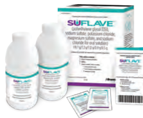
Bottles and packets not shown actual size.

SUFLAVE™ (polyethylene glycol 3350, sodium sulfate, potassium chloride, magnesium sulfate, and sodium chloride for oral solution) 178.7 g/7.3 g/1.12 g/0.9 g/0.5 g